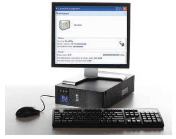
The 5S fits in small spaces and can also be used as a monitor stand.