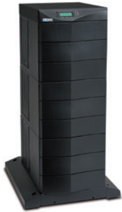
9170+ 9-slot configuration