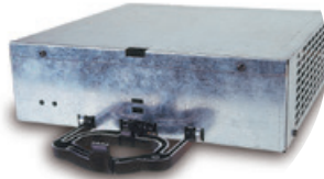
3 kVA power or charger module (one per slot)