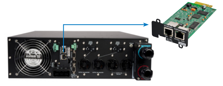
The bundled Network Card-MS allows the 9PX to connect to an Ethernet network and the Internet, supporting real-time monitoring and control of UPSs across the network via a standard Web browser, SNMP-compliant network management system or power management software.