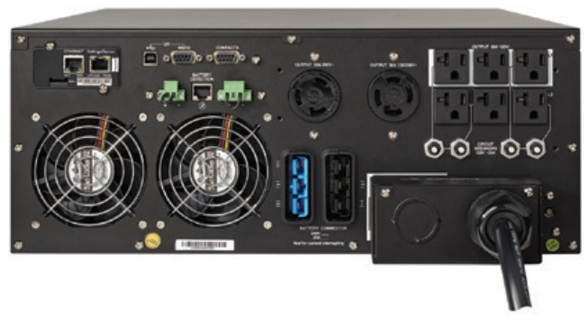
Split-phase models incorporate flexible receptacle configurations that natively offer both 208 and 120 volt. Rear panel of 9PX 6K split-phase shown above.