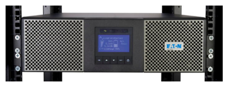
Each 9PX includes a 4-post rail kit.

The 9PX has the versatility to meet the demands of a wide array of IT applications.