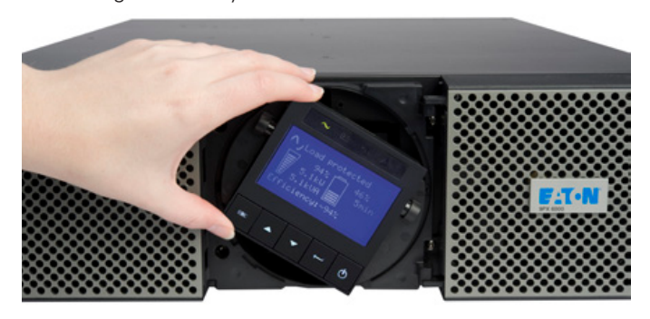
The 9PX displays key data such as its up to 93 percent efficiency rating, alarm history, runtime remaining, load percentage and more in a graphical format.

With an LCD interface that tilts 45 degrees for optimal viewing, rotates to match rack and tower installations, and provides clear information on UPS status and measurements, the 9PX makes local management easy.